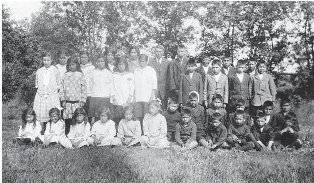
In 1900, only fourteen of thirty-four students at the Anglican school in Onion Lake, Saskatchewan, had Treaty status. Many of the remaining twenty students were likely to have been Métis.