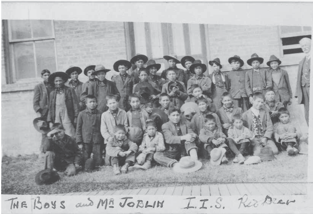
In 1909, seventeen of the forty-five students at the Red Deer, Alberta, school were Métis. United Church of Canada Archives, 93 049P849N.