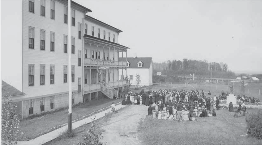
The Joussard, Alberta, school enrolled a large number of Métis students in the 1950s.