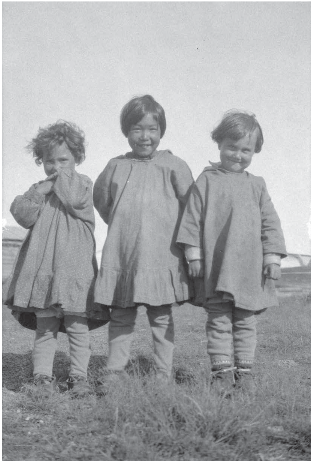
Two Métis children with an Inuit child at an Anglican residential school in northern Canada.

Library and Archives Canada, J. F. Moran, Department of Indian Affairs and Northern Development fonds, PA-102086.