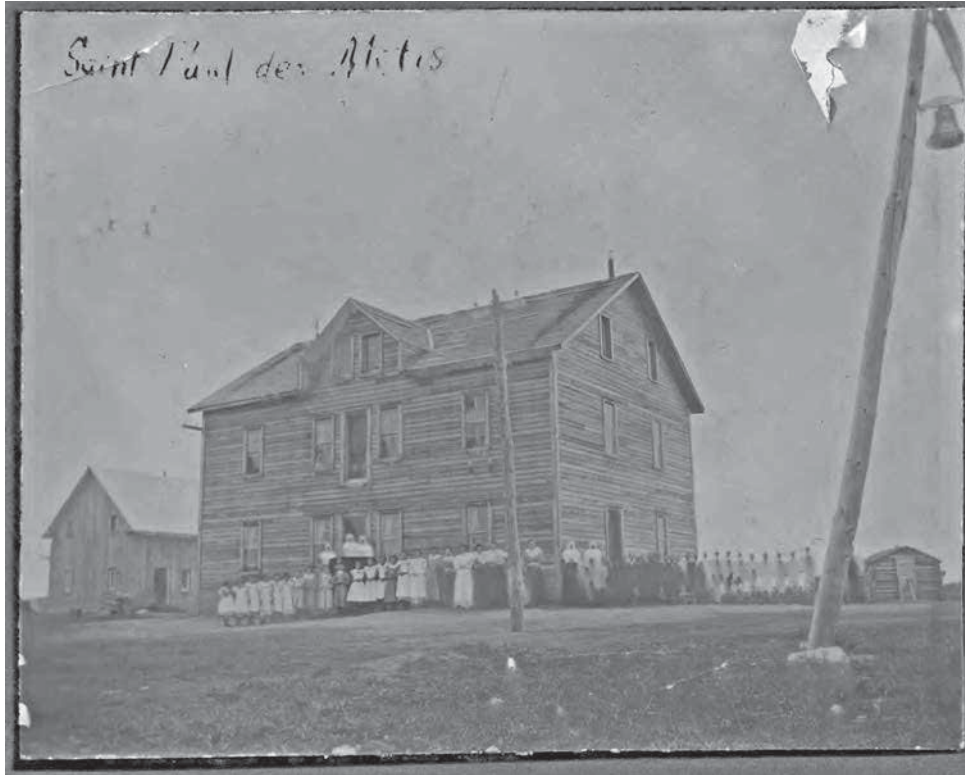
The Saint-Paul-des-Métis, Alberta, school was built on a colony for Métis people that the Oblate order established in 1896 in what is now Alberta. The school was destroyed by a fire set by students in 1905.