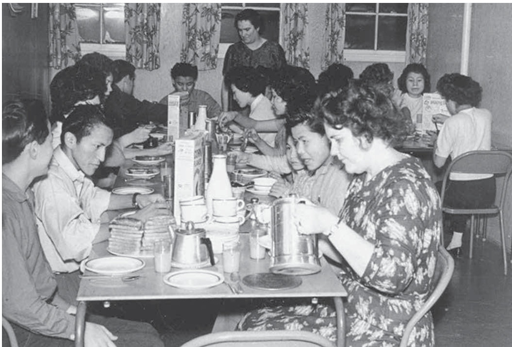
Métis students at the Anglican hostel in Whitehorse in the Yukon Territories. In 1955, there were thirty-one students living in the hostel. General Synod Archives, Anglican Church of Canada, P7561-219.