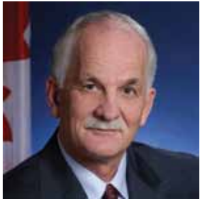
The Honourable Vic Toews, P.C., Q.C., M.P. Minister of Public Safety